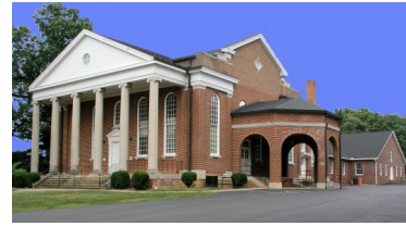
Old Providence ARP Church